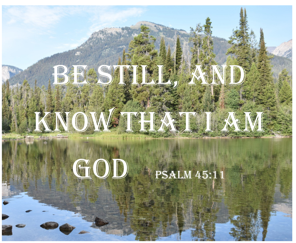
Basilian Spirituality Center 710 Fox Chase Rd, Jenkintown, PA 19046