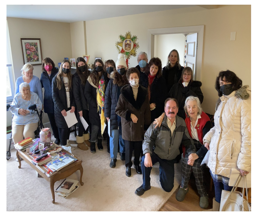
health reasons. Additionally, we also did fundraising by caroling, and $2105 will be donated to All Saints Camp.

This year we went caroling both as a fundraiser and also to visit shut-ins. We visited members of our parish who are unable to attend church because of